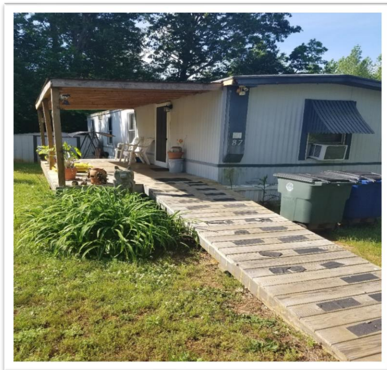
Existing ramp and porch. Handrails to be added