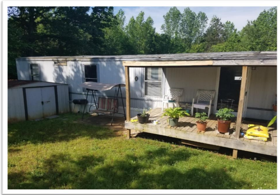
Front view of house